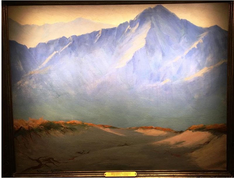
The club has an extensive collection of art of the West.