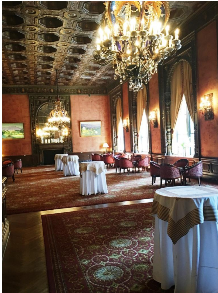
One of numerous meeting/function rooms.