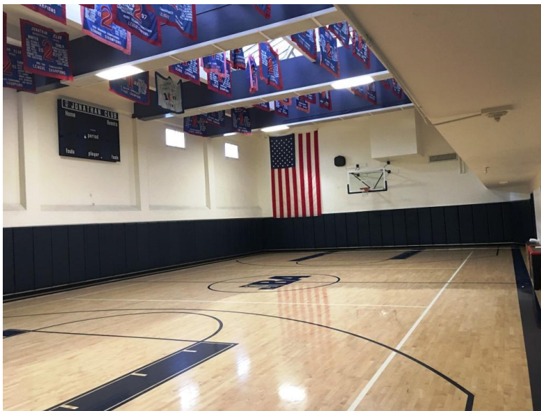
The basketball and pickleball court.