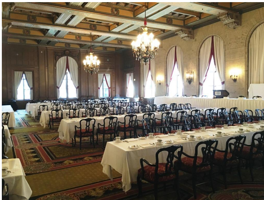
Another meeting room, set up for a speech with head table.