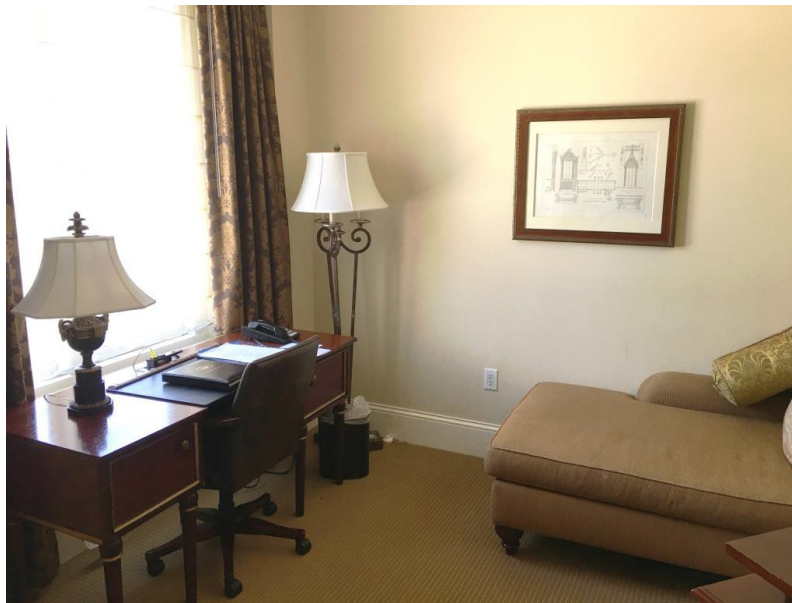
Sitting room in a junior suite.